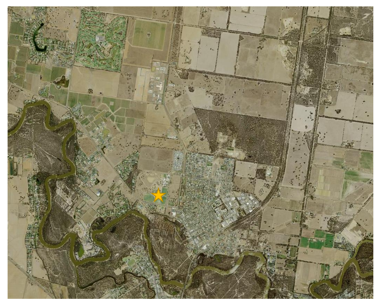
Figure 3: Surrounding area