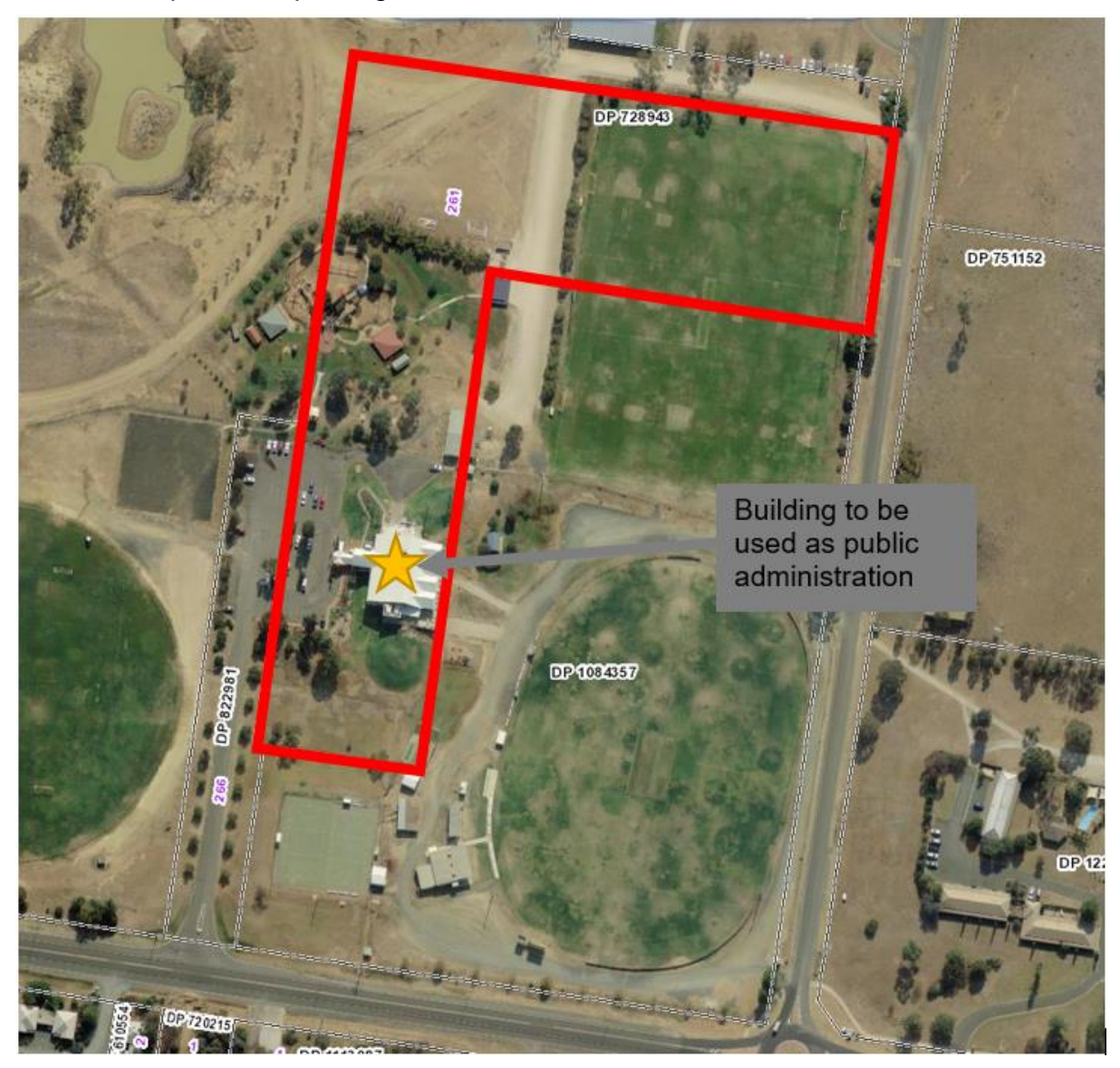
Figure 1: Subject Site

The building is a two storey complex located in the southern section of the land. Also situated on the land to the north of the building is a part of the Moama Playpark, part of a multi-purpose playing field, part of a toilet block facility, and land used for vehicle access and public carparking.